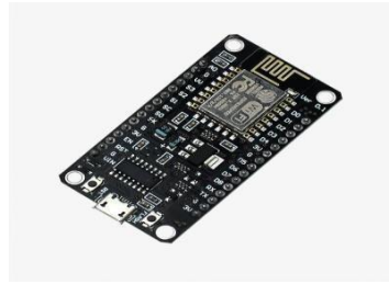
FIGURE 6. ESP8266(WIFI)

The ESP8266 is a low-cost, highly integrated Wi-Fi module designed by Espressif Systems that is commonly used to enable Internet access in embedded systems and IoT applications. It has a 32-bit Tensilica L106 microcontroller running at up to 80 MHz and a built-in TCP/IP stack, allowing devices to connect to Wi-Fi networks without the need for a second microcontroller. The module works at 3.0V-3.6V and supports both Station (STA) and Access Point (AP) modes, allowing for flexible network setups. It provides GPIO pins, UART, SPI, and I 2 C interfaces, making it adaptable for communicating with sensors, actuators, and other devices. Popular variants like the ESP-01 are compact and easy to integrate, while development boards like NodeMCU simplify prototyping with USB programming and expanded I/O. The ESP8266 is widely used in home automation, wearable tech, smart appliances, and biomedical IoT systems due to its affordability, low power consumption, and strong community support.