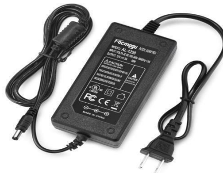
Figure 1. 12V Adaptor

The 12V power adaptor is a crucial device that converts standard 100–240V AC input into a stable, regulated 12V DC output. It provides safe and reliable power for low-voltage electronic systems, safeguarding sensitive biomedical circuits from voltage fluctuations. Employing switching regulator technology, the adaptor ensures high efficiency, a compact form factor, and minimal heat production. Its current rating is chosen based on the needs of connected components such as microcontrollers, sensors, and actuators. In this project, the 12V adaptor serves as the primary power source, delivering continuous operation, compatibility, and user safety, making it well-suited for wearable biomedical devices.