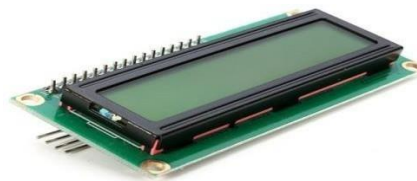
Figure 7. Display

A display module is an electronic output device used to visually present data, text, graphics, or system status in embedded systems and IoT applications. Common types include LCD (Liquid Crystal Display), OLED (Organic Light Emitting Diode), and TFT (Thin-Film Transistor) displays, each offering different resolutions, sizes, and power consumption characteristics. In embedded projects, compact displays such as 16x2 or 20x4 character LCDs are widely used for simple text output, while TFT and OLED screens provide richer, high-resolution graphical interfaces for advanced systems. Displays typically interface with microcontrollers through I 2 C, SPI, or parallel communication, making them easy to integrate with platforms like STM32, Arduino, and Raspberry Pi. They are essential for real-time data monitoring, menu navigation, debugging, and user interaction in applications ranging from biomedical devices and wearables to robotics and industrial automation. Low-power versions are often chosen for portable systems to optimize battery life.