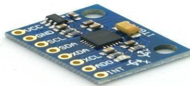
Figure 5. MPU6050 Sensor

The MPU6050 is a highly integrated MEMS (Micro-Electro- Mechanical Systems) sensor module that includes a 3-axis gyroscope and a 3-axis accelerometer on a single chip, allowing for precise motion tracking and orientation detection. It uses the I 2 C communication standard for easy interaction with microcontrollers like Arduino and STM32. The sensor measures both acceleration (g) and angular velocity (°/s), making it appropriate for a variety of applications including robots, drones, gesture recognition, motion tracking, and wearables. This 3V-5V device has exceptional sensitivity and adjustable ranges for the accelerometer ( \pm 2g to \pm 16g ) and gyroscope ( \pm 250^\circ/s to \pm 2000^\circ/s ). The MPU6050 also features a Digital Motion Processor (DMP), which enables onboard sensor fusion and reduces the microcontroller's computing load. Its compact size, low power consumption, and accuracy make it an excellent choice for embedded systems that require real-time motion and orientation detection.