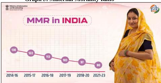
Graph 3: Maternal Mortality Ratio

The following Graph 3 shows the Maternal Mortality Ratio (MMR) in India. With the efforts of Government in providing the antenatal care for pregnant women showed a notable development in India’s MMR. There is a declined from 130 per lakh live birth in 2014-16 to 80 per lakh live birth in 2021-23, which is a reduction of 50 points.